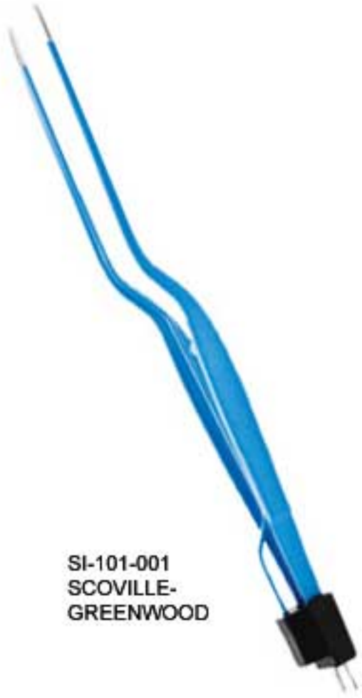
SI-101-001 SCOVILLE- GREENWOOD