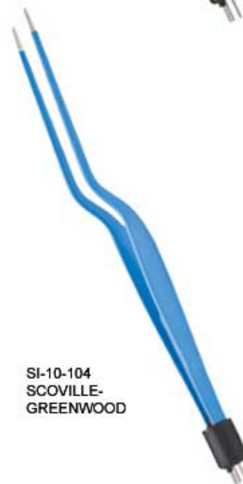
SI-10-104 SCOVILLE- GREENWOOD