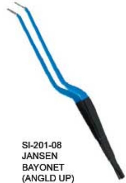
SI-201-08 JANSEN BAYONET (ANGLD UP)