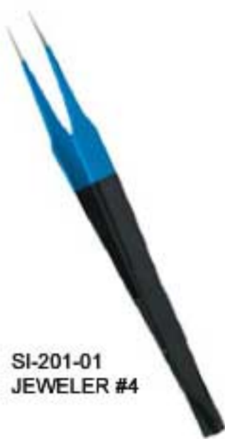
SI-201-01 JEWELER #4