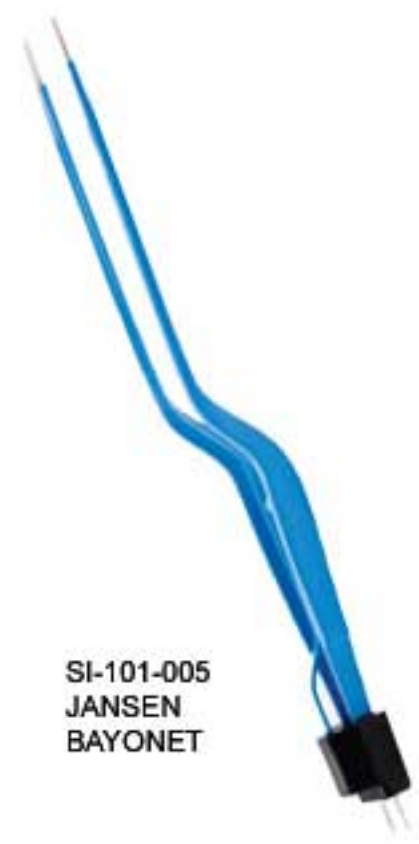
SI-101-005 JANSEN BAYONET