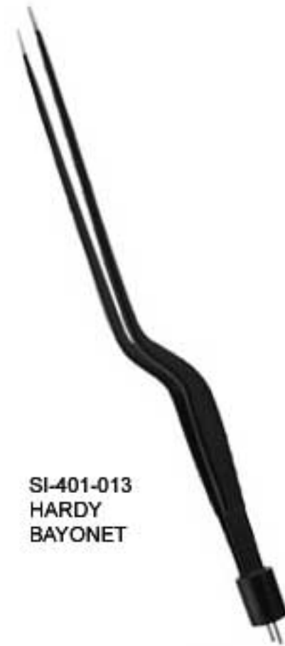
SI-401-013 HARDY BAYONET