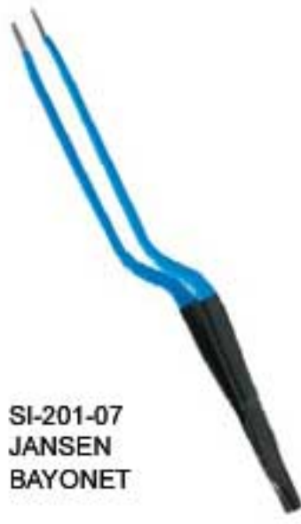
SI-201-07 JANSEN BAYONET