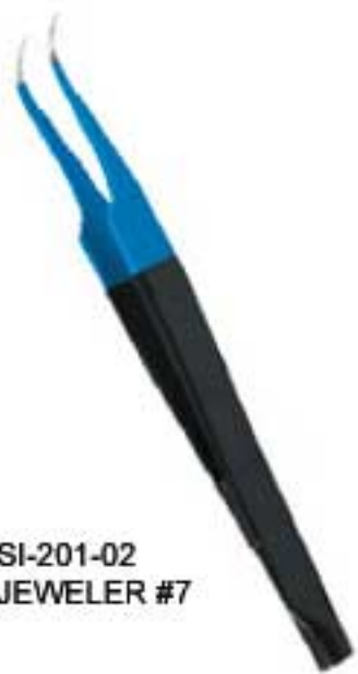
SI-201-02 JEWELER #7