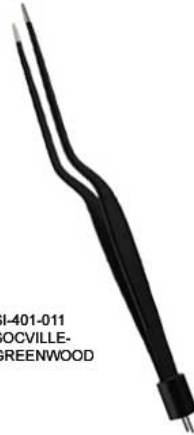
SI-401-011 SOCVILLE- GREENWOOD