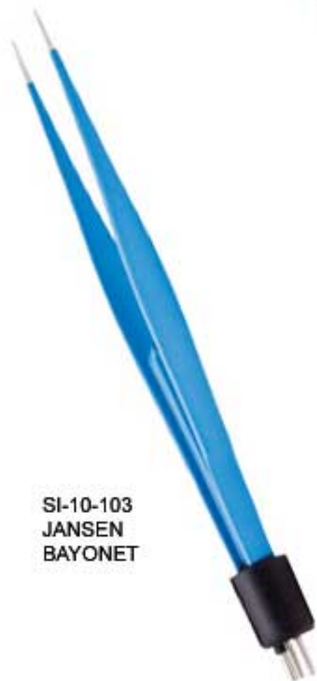
SI-10-103 JANSEN BAYONET