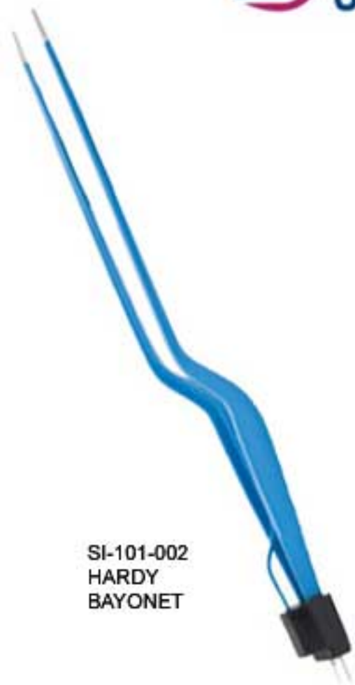
SI-101-002 HARDY BAYONET